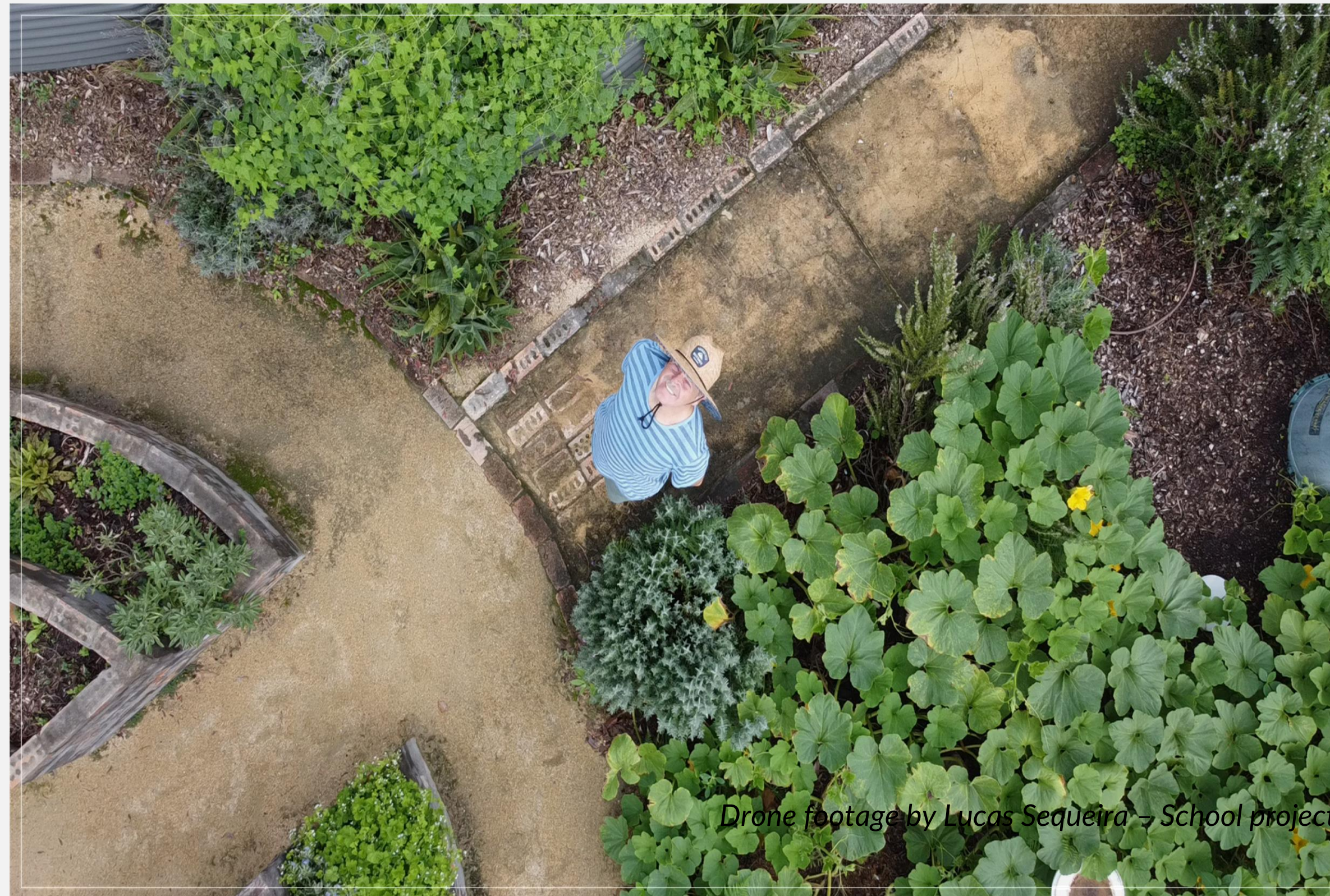
Drone footage by Lucas Sequeira - School project